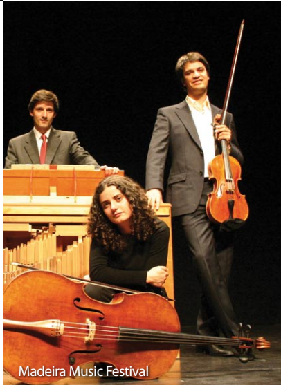
Madeira Music Festival

June Madeira Music Festival – Classical music concerts This event is held on the first half of June, in some of the most emblematic buildings of the island, enclosing sacred music, ballet and contemporary dance and repertoires for piano and orchestra by great composers. Organization: DRAC