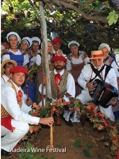
Madeira Wine Festival

Madeira Wine Festival The Madeira Wine trade reached its peak in the seventeenth and eighteenth centuries, promoting the island name throughout the main trading ports in the world. This activity which connects farmers, producers and traders, reaches its peak during the harvesting period; therefore, Madeira Wine Festival takes place during the harvest months. The event takes place between Funchal, stage to various entertainment activities and live scenes, and Estreito de Câmara de Lobos where a "Live wine Harvest" occurs.