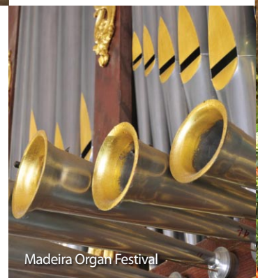
Madeira Organ Festival

October Madeira Organ Festival This festival is comprised by a wide range of concerts held at various churches and venues in the island, where people are given the opportunity to listen to the works of the most renowned composers of ancient and sacred music, complemented by chamber music groups or by an orchestra. Organization: DRAC For further information: www.festivaisculturaismadamadeira.com