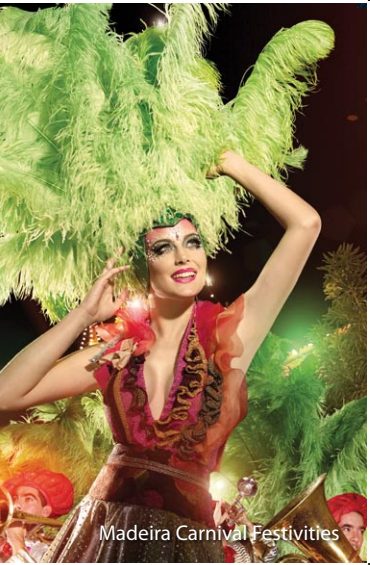
Madeira Carnival Festivities