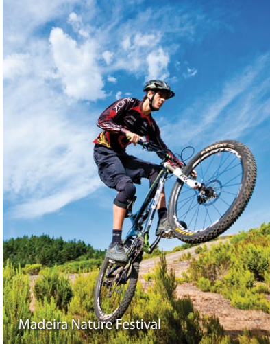
Madeira Nature Festival