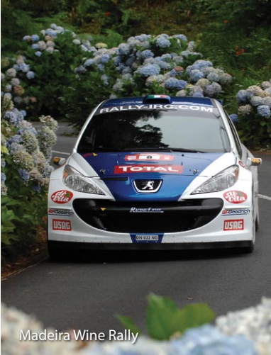
Madeira Wine Rally

Madeira Wine Rally The Madeira Wine Rally, held for over half a century, is the most famous and challenging automobile event in the region. Organised by the Madeira Sports Club this race, is followed by thousands of islanders, who seek the best places to observe the skill of the drivers in our very distinctive roads. The rally takes place on the last weekend of July gathering famous national and foreign pilots. This race integrates the Portugal's Rally Championship.