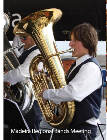
Madeira Regional Bands Meeting

May Madeira Regional Bands Meeting Ribeira Brava annually hosts Madeira Regional Bands Meeting, promoting this musical genre and the work of various entities which dedicate to promote and preserve Philharmonic bands. Organization: DRAC, Ribeira Brava Municipality and Madeira Philharmonic Bands Association