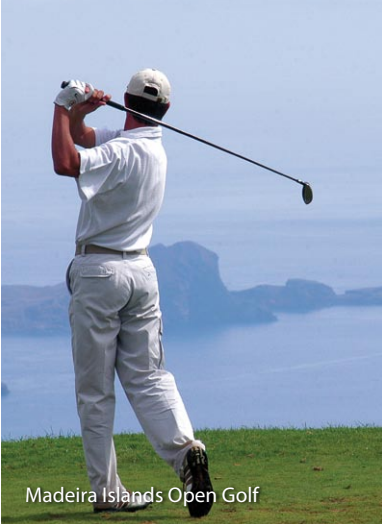
Madeira Islands Open Golf

Madeira Islands Open Golf Madeira Islands annually hosts "Madeira Islands Open Golf" an event integrated in the European Tour, one of the most credited golf circuits in the world, in recognition to the excellent conditions that Madeira Islands three main golf courses offers for the practice of golf. If you play golf or if you are simply a golf lover, here you will find the ideal conditions to enjoy this sport while relishing the breathtaking natural scenery of the island.