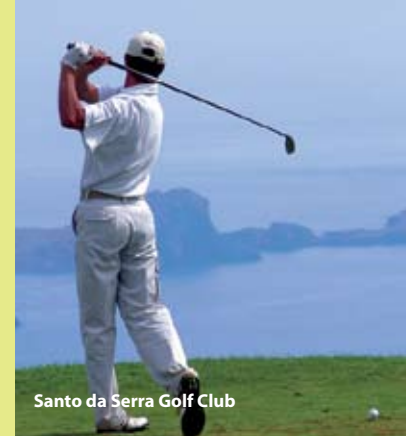
Santo da Serra Golf Club