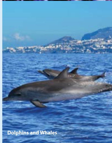
Dolphins and Whales