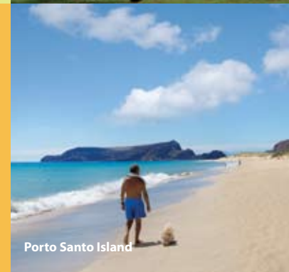
Porto Santo Island